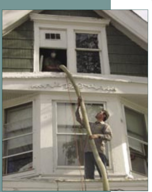
An older home in Wisconsin gets upgraded insulation blown in, with lower heating and cooling bills just ahead for the low-income homeowner, thanks to a Community Action weatherization crew.

Tommunity Action Agencies and Partnerships across the nation are key distribution links for state- and federally funded heating assistance, helping hundreds of thousands of households meet gas, oil, or electric heat bills they could not oth-