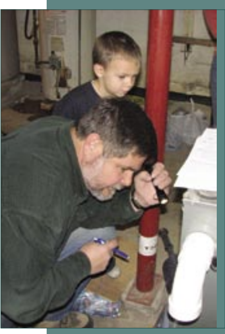
A Community Action Agency staff member conducts an energy audit with help from a 3-year-old resident in Westmoreland, NY. Audit findings help target weatherization work.